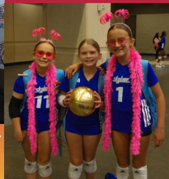
DIG PINK DAY TO RAISE AWARENESS ABOUT METASTATIC BREAST CANCER

UPGRADED ENTRANCE AND CUSTOM SIGNAGE FOR THAT EXCLUSIVE EXPERIENCE!