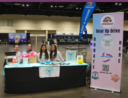
GEAR UP DRIVE POWERED BY GEAR4ALL & GEAR FOR GLORY

COLLECTING NEW AND USED SPORTS EQUIPMENT TO DONATE TO PLAYERS AND TEAMS IN NEED.