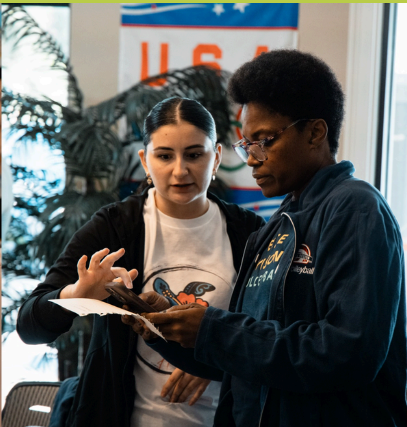
2025 FLORIDA REGION NEW CLUB DIRECTOR MEETING | EUSTIS, FL

"BELIEVE YOU CAN AND YOU'RE HALFWAY THERE" - THEODORE ROOSEVELT